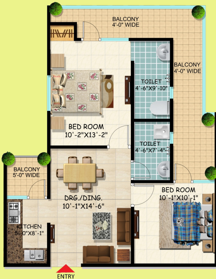
TYPE-3 2BHK + 2 TOILET SUPER AREA :- 1125 SQ.FT