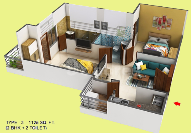
TYPE - 3 - 1125 SQ. FT. (2 BHK + 2 TOILET)