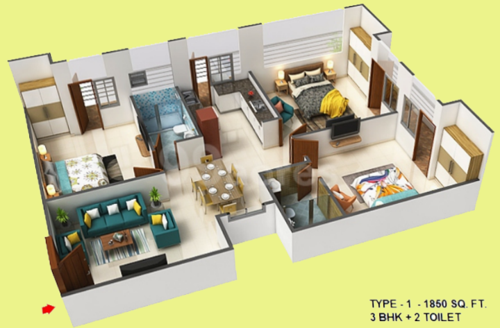
TYPE - 1 - 1850 SQ. FT. 3 BHK + 2 TOILET