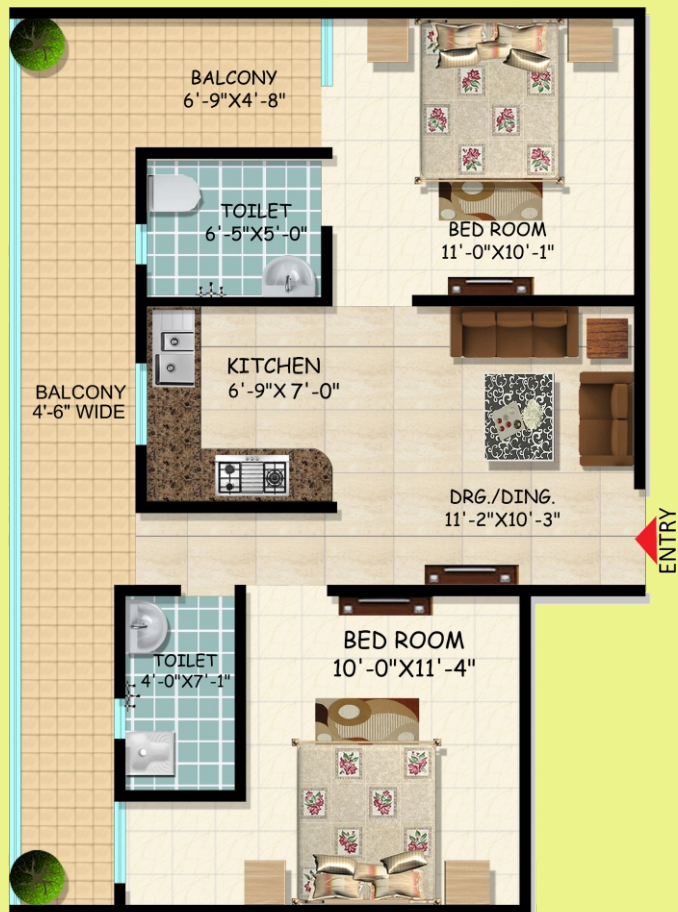
TYPE-8 2BHK + 2 TOILET SUPER AREA :- 1200 SQ.FT