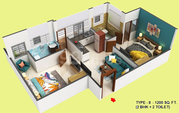
TYPE - 8 - 1200 SQ. FT. (2 BHK + 2 TOILET)