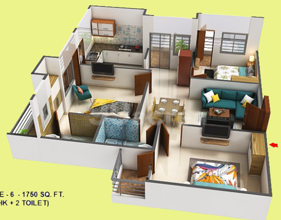
TYPE - 6 - 1750 SQ. FT. (3BHK + 2 TOILET)