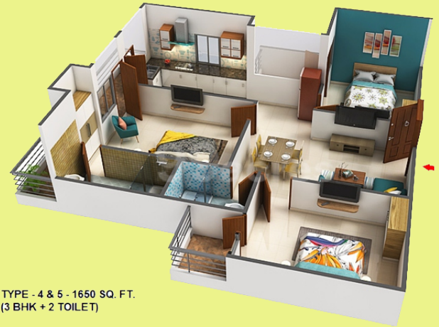
TYPE - 4 & 5 - 1650 SQ. FT. (3 BHK + 2 TOILET)