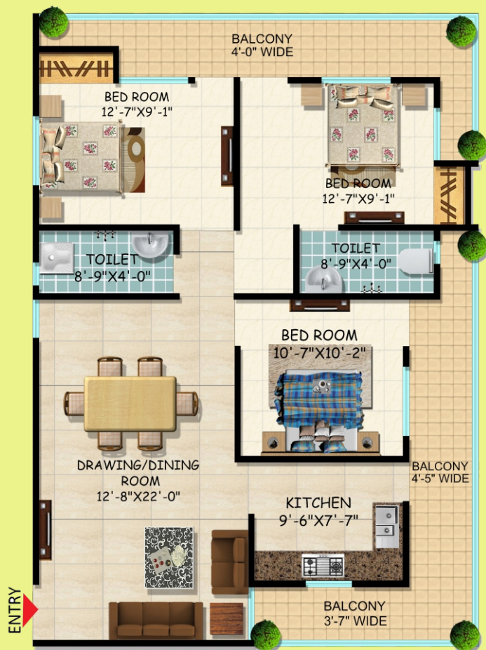
TYPE-7 3BHK + 2 TOILET SUPER AREA :- 1825 SQ.FT