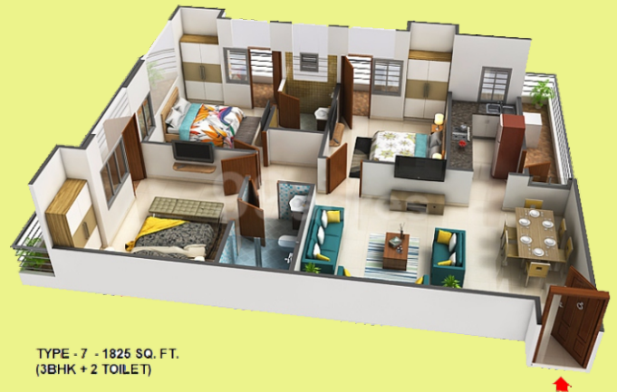
TYPE - 7 - 1825 SQ. FT. (3BHK + 2 TOILET)