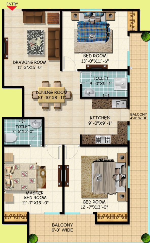
TYPE-1 3BHK + 2 TOILET SUPER AREA :- 1850 SQ.FT