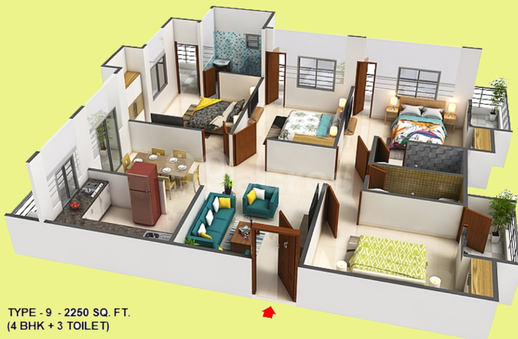
TYPE - 9 - 2250 SQ. FT. (4 BHK + 3 TOILET)