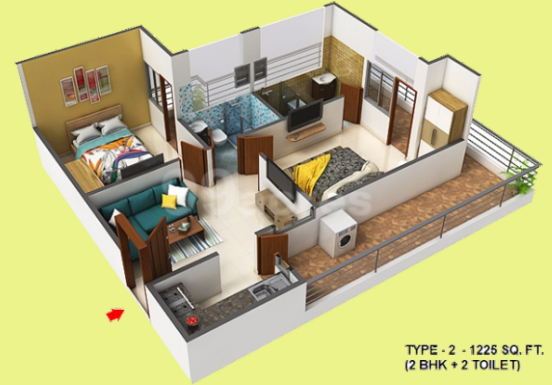
TYPE - 2 - 1225 SQ. FT. (2 BHK + 2 TOILET)