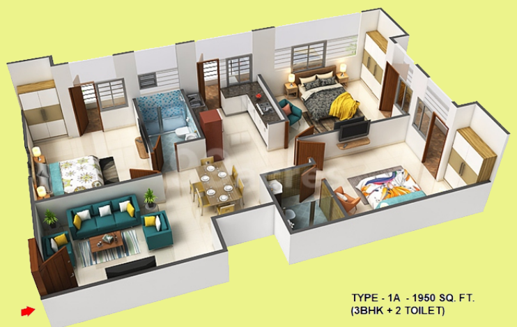
TYPE - 1A - 1950 SQ. FT. (3BHK + 2 TOILET)