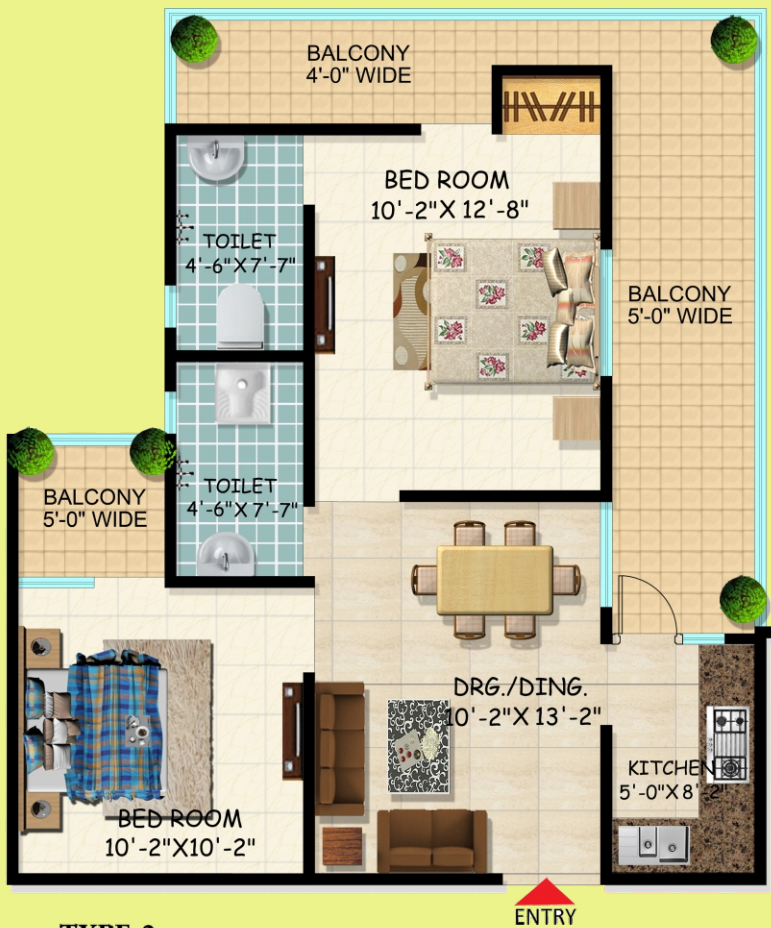
TYPE-2 2BHK + 2 TOILET SUPER AREA :- 1225 SQ.FT